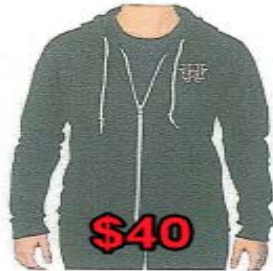
Ladies Full-Zip Hoodie