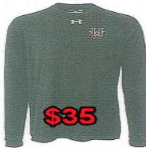
Men's Long sleeve